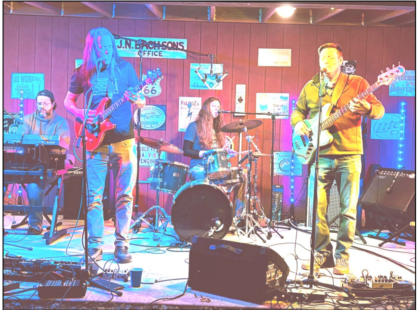
Wildermore performing at the 2023 FGNA Palooza.

With ongoing support from sponsors, performers, sound engineers and audience members, Palooza will keep coming back stronger and better every year.